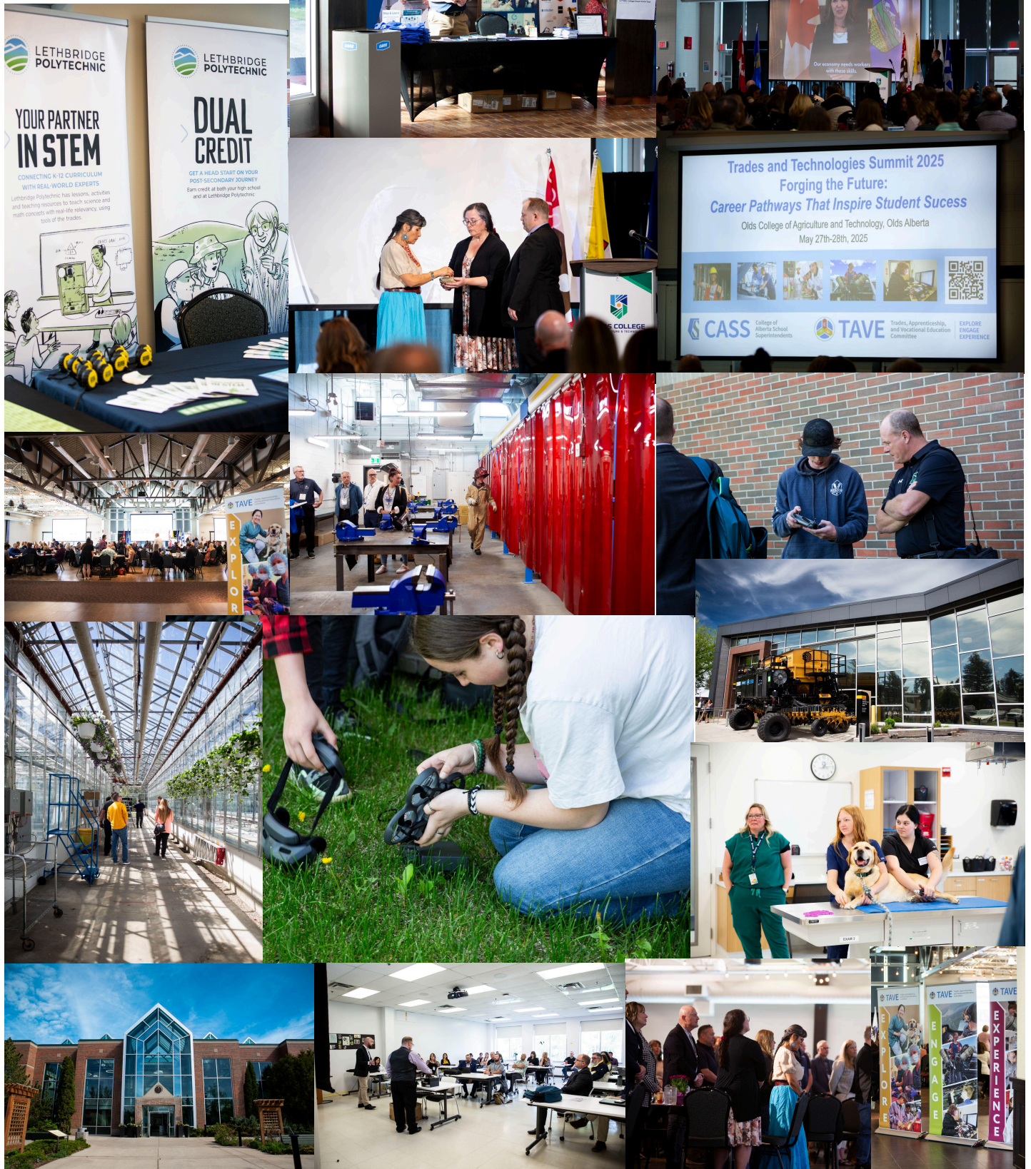
Trades and Technologies Summit: Shaping Futures Highlights Summary